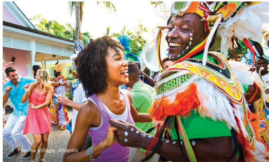
Marina Village, Atlantis