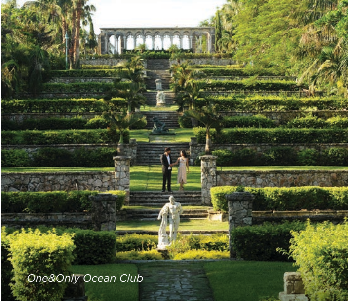
One&Only Ocean Club