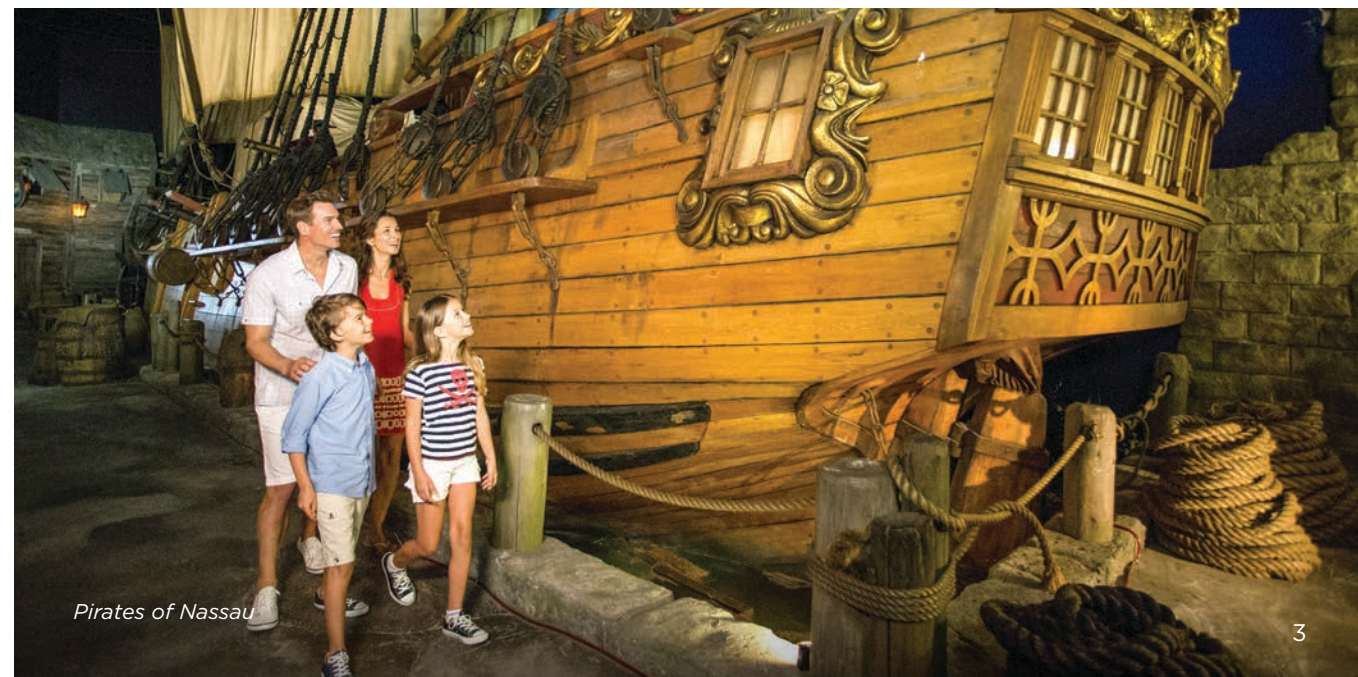
Pirates of Nassau

Captain Woodes Rogers was appointed Royal Governor of The Bahamas in 1717. Before his duty as governor, Rogers was a privateer from England sent on expeditions in order to harass Spanish colonies throughout the Atlantic Coast.