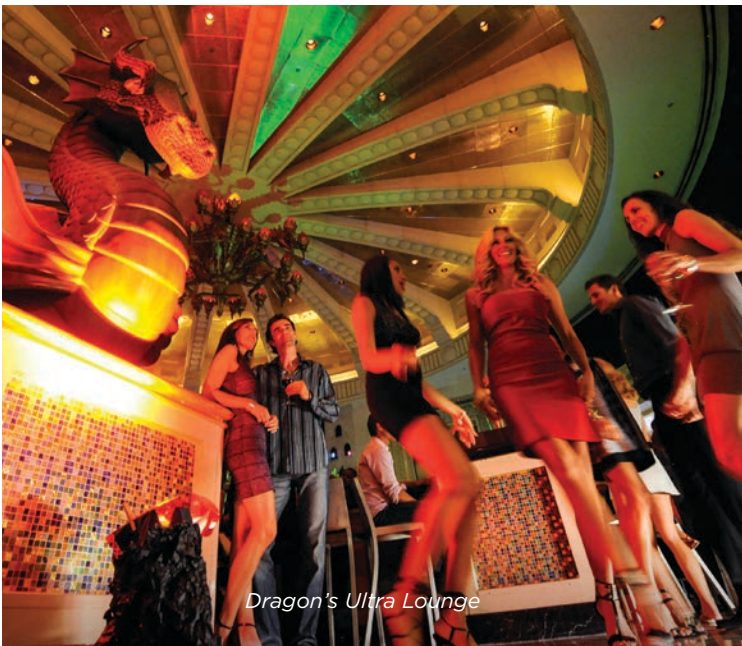
Dragon's Ultra Lounge