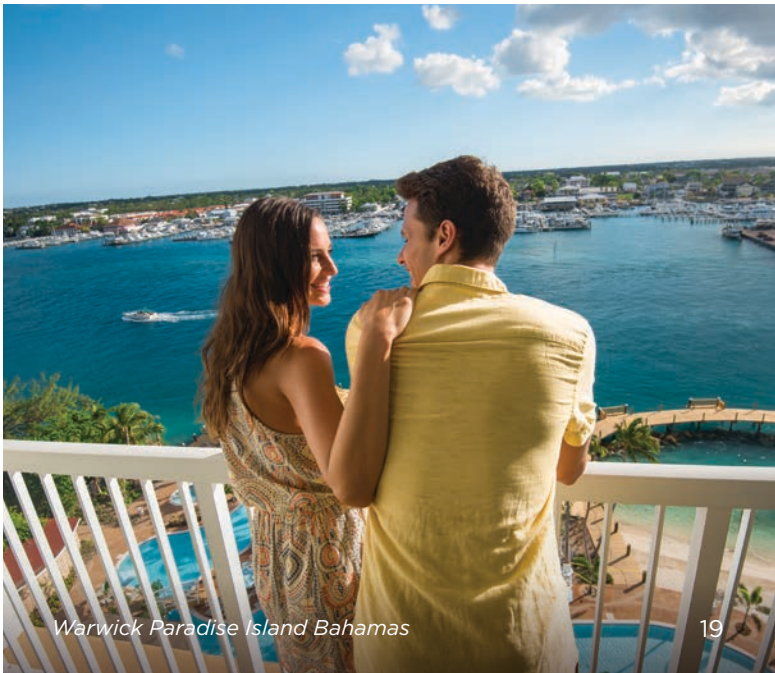
Warwick Paradise Island Bahamas