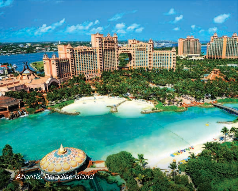
Atlantis, Paradise Island