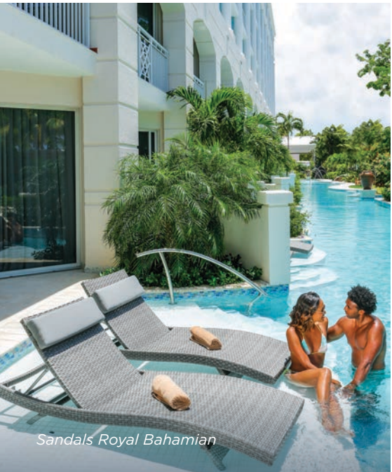
Sandals Royal Bahamian

Astronauts have remarked about the clear, turquoise waters of The Bahamas. But don't take their word for it—see it for yourself. Google Earth features detailed images that prove just how fantastic the waters that surround Nassau Paradise Island truly are.