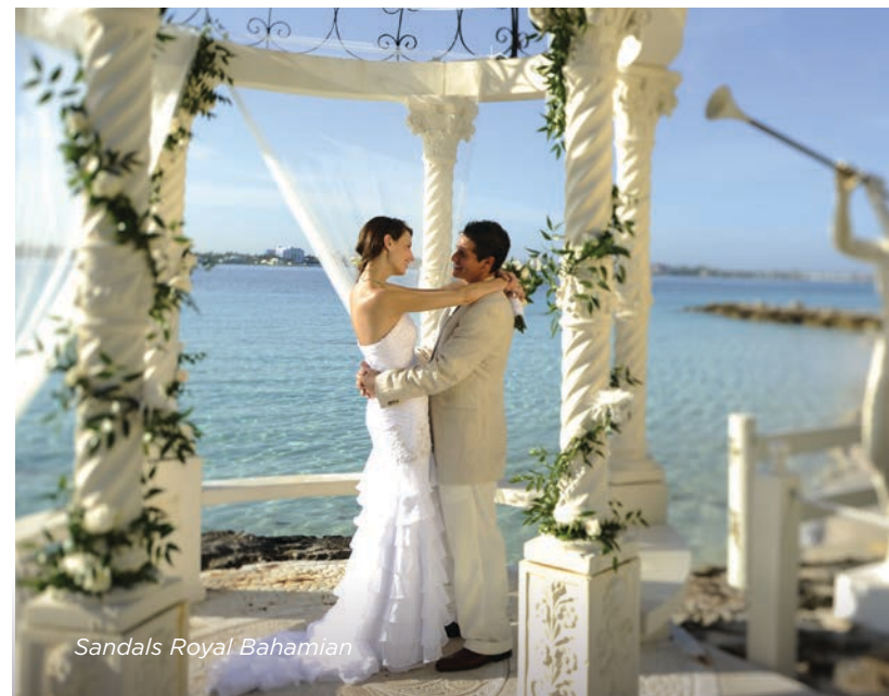
Sandals Royal Bahamian