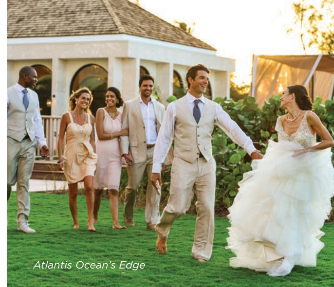
Atlantis Ocean's Edge

With so many romantic possibilities, no wonder countless couples say "I do" to Nassau Paradise Island.