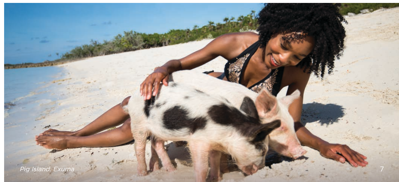
Pig Island, Exuma