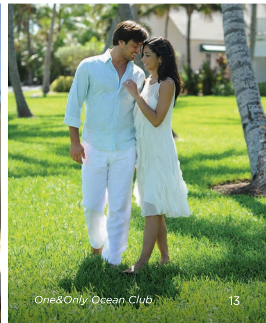
One&Only Ocean Club